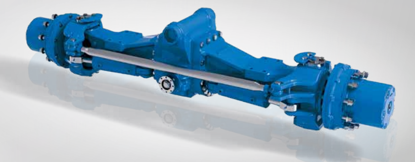
Fig. LAP 55