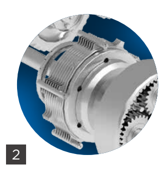
PATENTED SELF-COOLED TURBO BRAKE